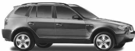
BMW OF DARIEN