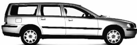
VOLVO OF WESTPORT