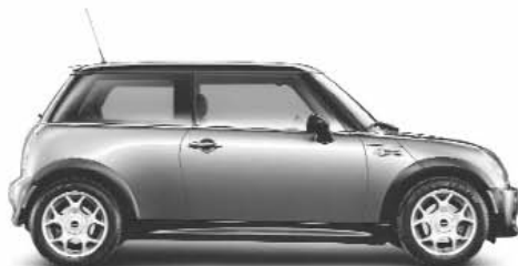
MINI OF FAIRFIELD COUNTY